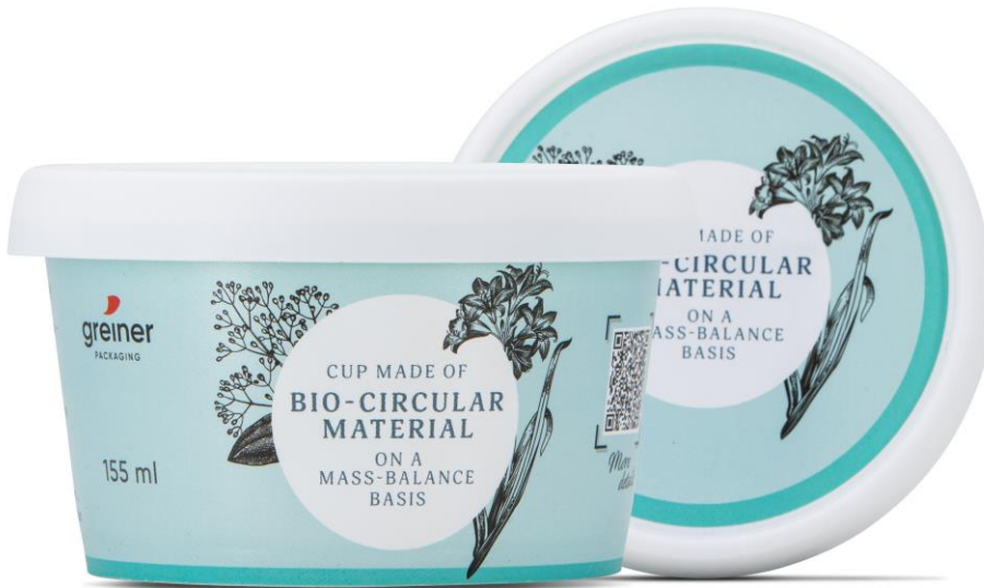
Caption: New prototype in-mold labeling cup produced by Greiner Packaging, made of renewable (bio-circular) polypropylene from Borealis (Borneables™).